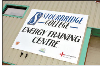
At the main entrance to the site

"We have first class facilities combined with staff that can provide an all round comprehensive train-